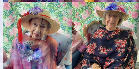
Moms enjoyed their glamour photo shoots on Mother's Day!