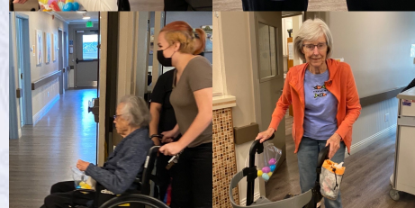
Who says egg-hunting is just for kids?