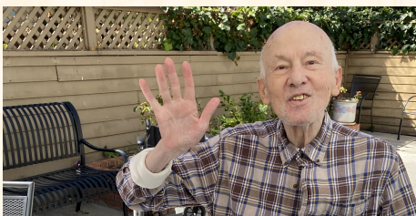
Happy and enjoying the fresh air!