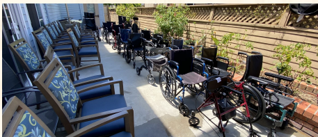
Wash day for residents' mobility devices/chairs