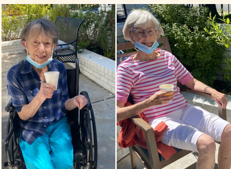
Girls just wanna have sun!