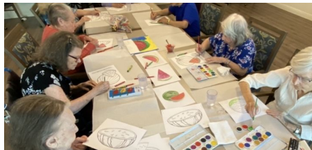
Arts & Crafts are always fun!