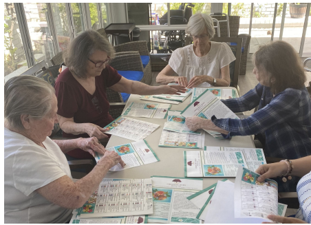
Ladies busy helping with folding our newsletter to mail for their family!