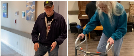
Residents have fun dancing!