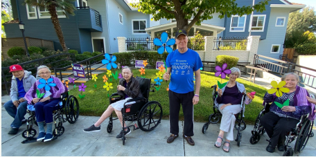
Our lovely residents with our community's ALZ Flower Garden