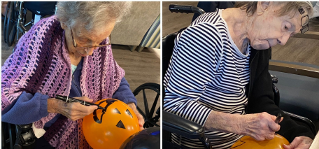
We had fun drawing pumpkin faces!