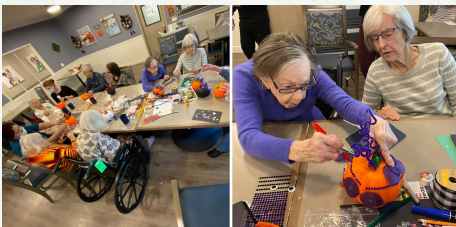
Having a blast decorating pumpkins!