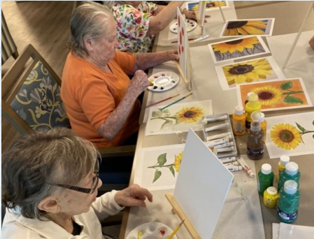
Ladies do oil paint, too! =)