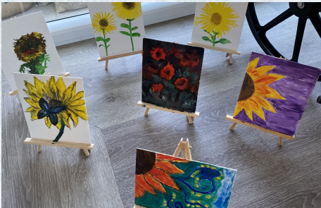
Residents did a great job with their oil painting. Everything looks awesome!